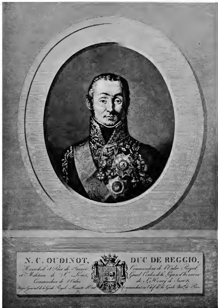
NICOLAS CHARLES OUDINOT, DUKE OF REGGIO FROM AN ENGRAVING AFTER THE PAINTING BY ROBERT LE FEVRE